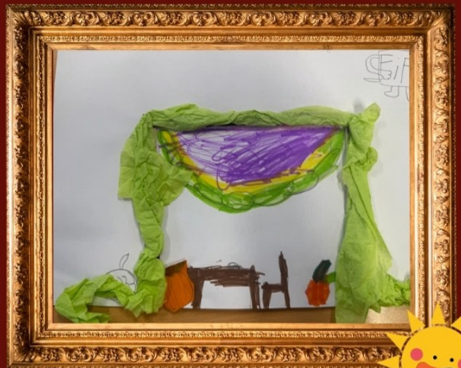
Fife 2MG did some lovely, creative work in RE when they learned all about Sukkah, the Jewish Celebration of Sukkot!