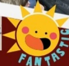
Reception created their own Funny Food Recipe in class during their Enrichment Day -